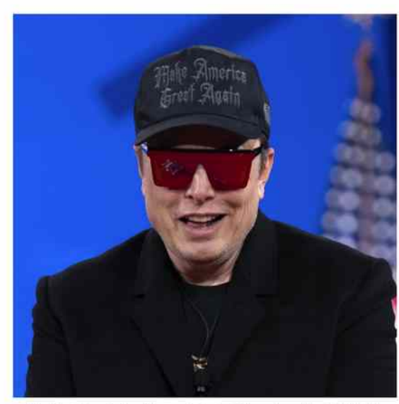
MAGA CREEPY! 'I WANT TO KNOCK YOU UP AGAIN!'